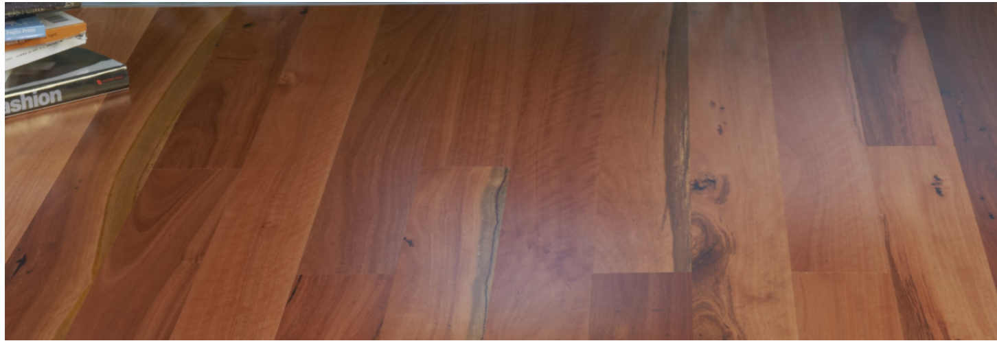
northern reds | available in 90mm & 136mm wide