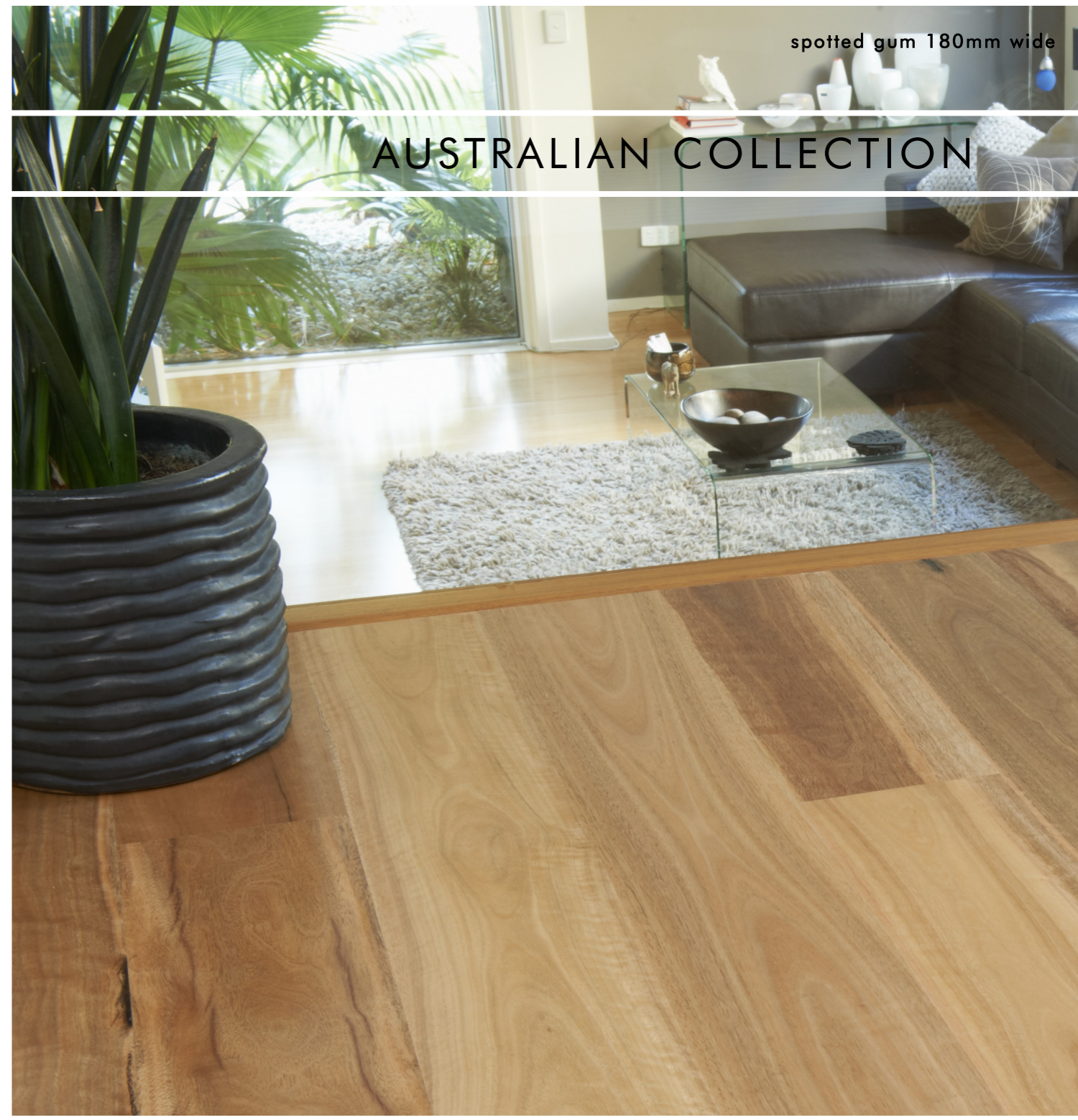
spotted gum 180mm wide