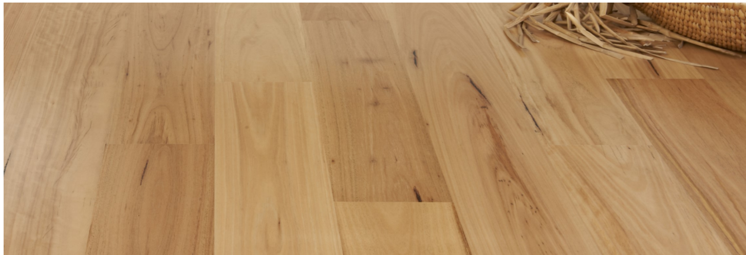
blackbutt | available in 90mm, 136mm* & 180mm wide