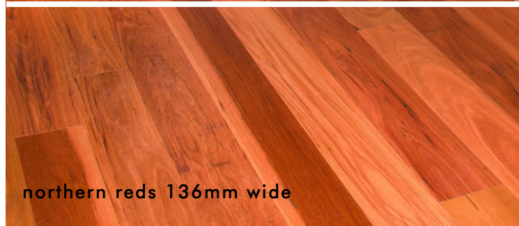
northern reds 136mm wide