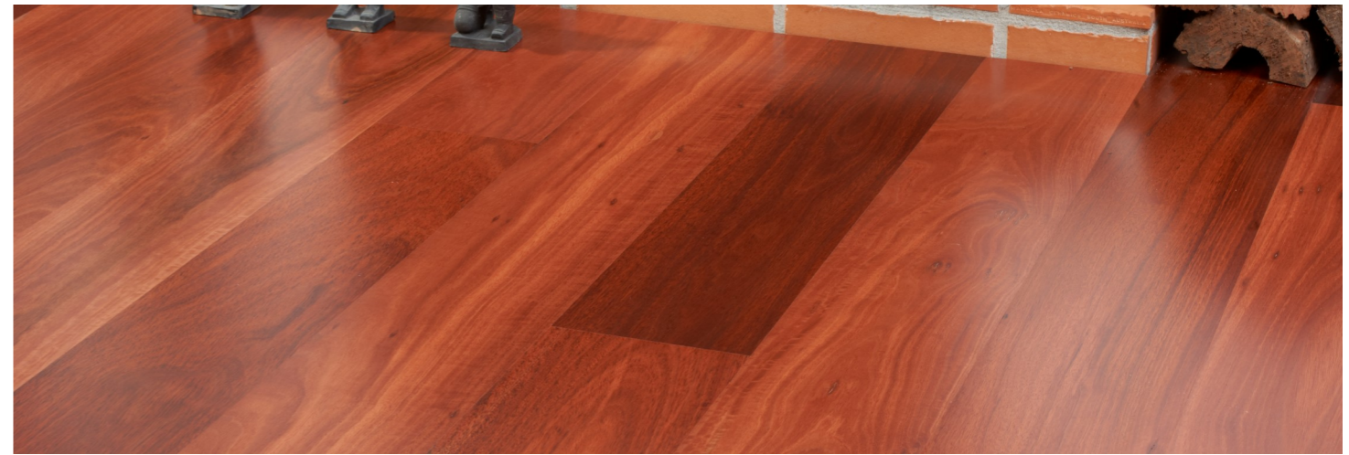
jarrah | available in 136mm & 180mm wide