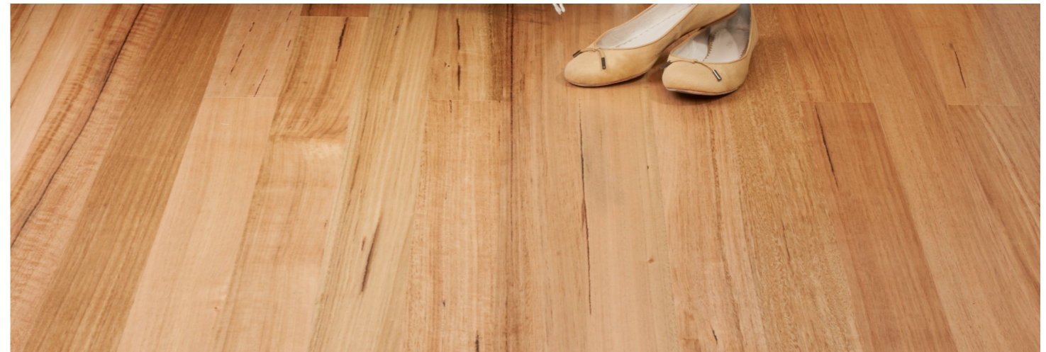
southern messmate | available in 90mm & 136mm wide